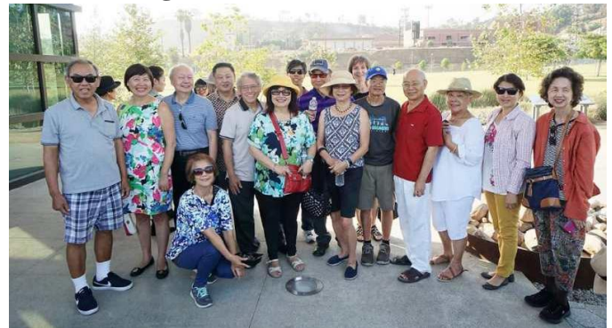
GSGV and LA Lodge members having a fun time at LA Lodge's Summer Picnic in Los Angeles State Historic Park. Aug. 25